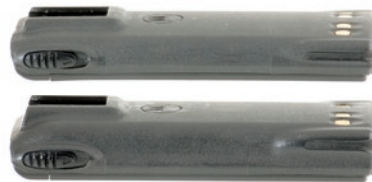
Different size cases suit batteries of different thicknesses.